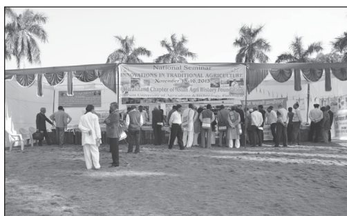
Stalls exhibiting agroproducts