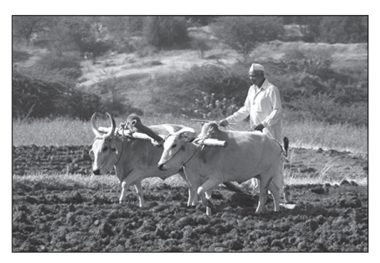
Figure 2. A farmer toiling the soil for cultivation.

The farmers of the region traditionally practice rainfed farming (Fig. 2). The major traditional crops are jowar (sorghum) (Fig. 3), bajra (pearl millet), cotton, tur (pigeonpea), and anuvulu or field beans ( Dolichos lablab L.) in the Maharashtra and Andhra Pradesh areas of the region, and sorghum and pigeonpea in Karnataka. The major rainy season crops cultivated in the area are sorghum, pigeonpea, pearl millet, and cotton. The postrainy season crops,