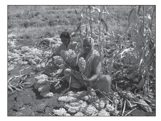
Figure 3. Harvest of sorghum, the staple food of the region.

grown on soils with residual moisture, are sorghum, safflower, and sunflower. The prolonged dry spells adversely affect the crop growth leading to frequent crop failures. The kharif sorghum is cultivated in the semi-arid districts, while cotton, pulses, groundnut, and small millets are sown as alternate crops. Sugarcane is an important crop in the Deccan Plateau areas of Maharashtra and northern Karnataka, where irrigation facilities are available through tube wells and irrigation canals. Sugarcane is planted during December-February, as a 12-month crop, which is referred as eksali (Fig. 4). In the extremely dry area of the Deccan in Andhra Pradesh, which is again a rainshadow region, bajra is cultivated. In the groundnut-based cultivated areas, the alternate crops are sorghum and small millets. In the dry districts of the Deccan plateau in northern Karnataka, the groundnut-based cropping system has sorghum as an alternate crop. Cotton, suited to dry climate and black soil is an important crop in the rainfed areas of the Deccan plateau, which includes the semi-arid districts in Maharashtra, northern