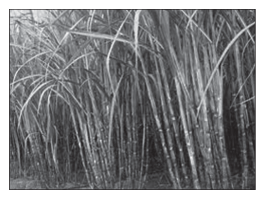
Figure 4. Sugarcane, the cash crop of the region.

Karnataka and eastern Andhra Pradesh (Fig. 5). In this area, the alternative crops are sorghum ( kharif and rabi ), groundnut, and small millets.