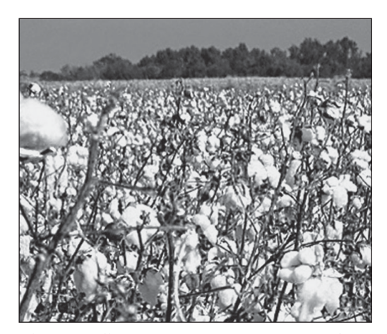
Figure 5. Cotton, the other cash crop of the region.