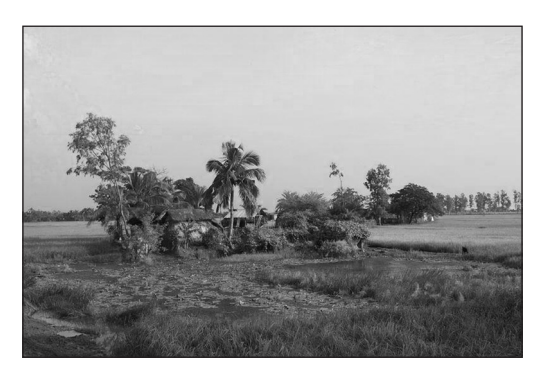
Figure 3. Diverse agriculture with rich crop diversity dominated by rice (Source: www. wikipedia.org).

100–130 km, with a network of estuaries, tidal rivers, and creeks intersected by numerous channels, enclosed flats, marshy islands covered with dense forests. In 1997, the Sundarbans were awarded the status of World Heritage Site by the UNESCO.