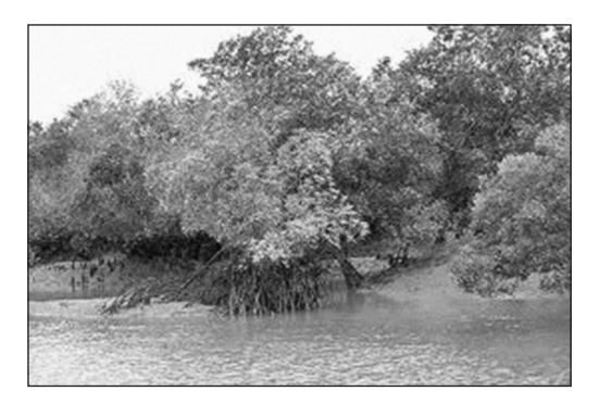
Figure 2. The Sundarbans, with unique and rich mangrove diversity.

largest mangrove ecoregion, covering an area of 20,400 km<sup>2</sup> in a chain of 54 islands (Fig. 2). The Sundarbans freshwater swamp forests ecoregion, lies closer to the Bay of Bengal, and is flooded with slightly brackish water during the dry season and freshwater during the monsoon season. These forests too, have almost been completely converted to intensive agriculture (Fig. 3). The Sundarbans derive their name from the predominant mangrove species, Heritiera fomes Wall., which is locally called sundri or sundari. Thus, the Sundarbans are a part of the world's largest delta covered by mangrove forest and vast saline mud flats. The whole tract reaches inland for