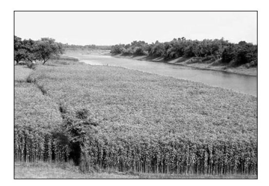
Figure 4. Commercial cultivation of jute.

Jute cultivation in the region can be classified into three areas: (i) Brahmaputra Alluvium , also called the Jat Area, which is inundated and replenished every year by fresh alluvial deposit, having soils acidic in nature, but produces the best quality jute (mostly Bangladesh) of the region; (ii) Ganges Alluvium , also called the District Area, has alkaline side of neutrality soils, and produces next to Jat jute in order of quality; and (iii) Teesta Silt , also called the Northern Area, which has a sandy soil with lower moisture