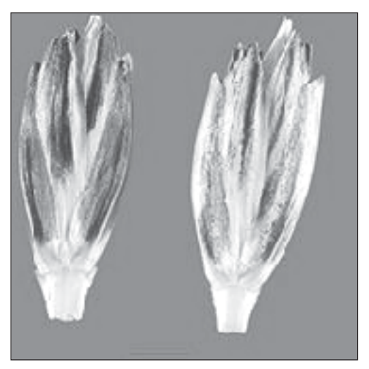
Figure 1. Spikeltes of Khapli wheat ( Triticum dicoccum ) with persistent glumes

Khapli emmer is resistant to those cultures of Erysiphe graminis f. sp. tritici with which it has been inoculated. 'Yuma' durum grown in Arizona in the US, which had Khapli as one parent, is resistant to the