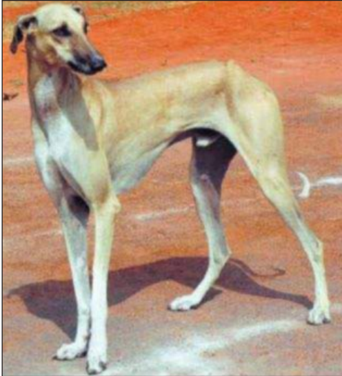
Figure 2. Chippiparai hound that is similar to Sarameya described by Someshvardeva.

without the assistance of modern tools and equipment deserve the unique place for the valuable contribution to the sum total of human knowledge.