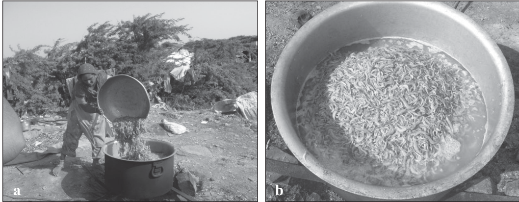
Figure 3. Processing of juvenile ginger prawns: (left) a woman using the traditional method; and (right) processed prawns ready for packaging.

crisis is a paradigm shift from the capture practice to culture practice. The capture-based aquaculture can be adopted for the optimization of the yield of this resource. During targeted fishing many juveniles of high-valued fishes are caught which are usually discarded or used for fish meal or sold for a much lower price unlike matured ones as they do not fetch good market price. The capture-based aquaculture is a newly growing concept in which these juveniles (after capture) are cultured for a short period until they attain a marketable size and at this size they fetch a very good price. This is a value addition process which not only provides a new source of earning but also helps indirectly in resource conservation. It has already been tested that the culture of M. kutchensis as a short-term crop can increase the price of the prawn by 30–40% compared to the captured prawns (Gopalakrishnan and Raju, 1990). Open water cage culture and pen culture demonstrations of this candidate species can attract the fishermen and diffusion of the culture technique by extension