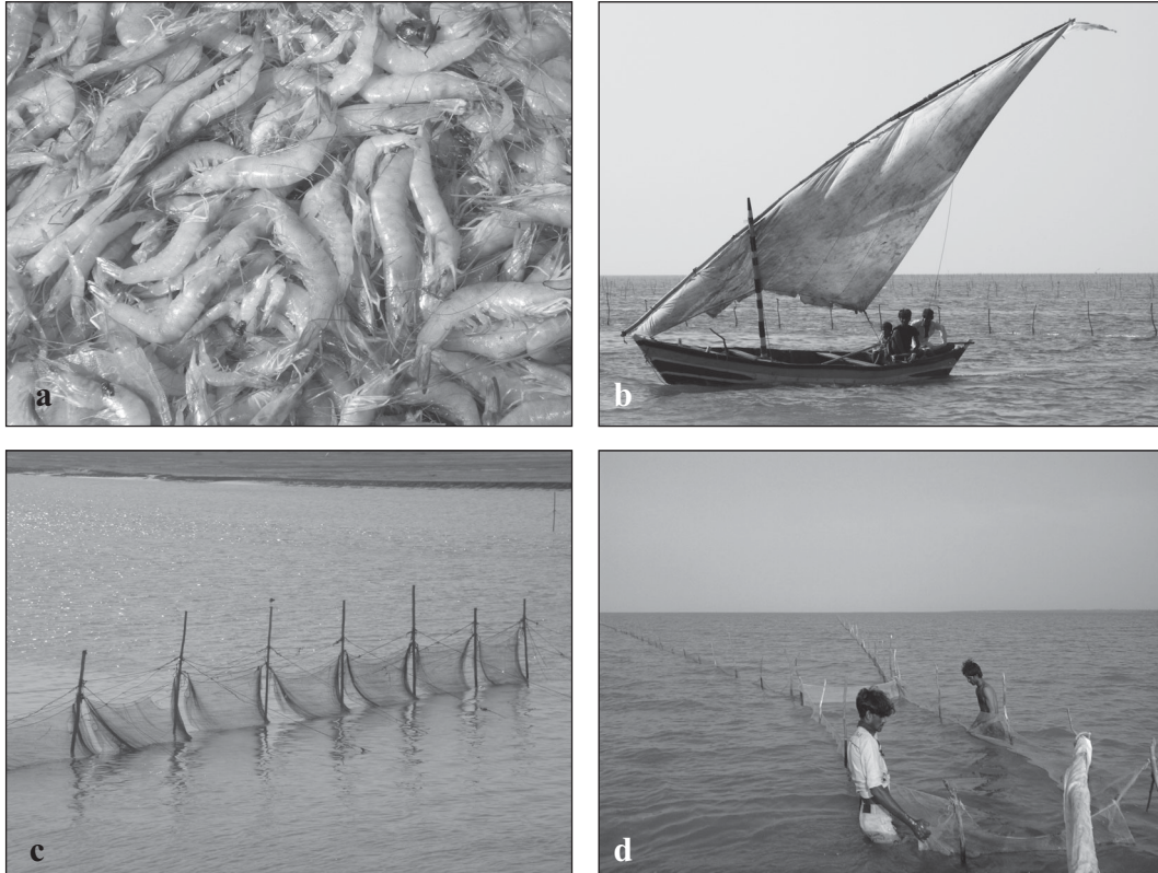
Figure 2. Craft and gears used in the fisheries: (a) Juvenile ginger prawn catch; (b) Traditional fishing craft 'Odie'; (c) Bag nets or 'Gunjas' in operation; and (d) Scissor net or 'Katar jaal' in operation.