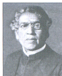
Sir JC Bose (1858–1937)

Centre for Cellular and Molecular Biology, Council of Scientific and Industrial Research, Uppal Road, Hyderabad 500007, Andhra Pradesh, India (email: amit@ccmb.res.in)